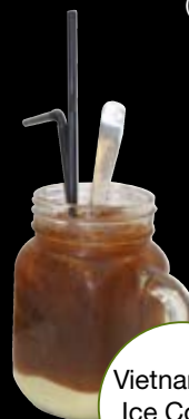
Vietnamese Ice Coffee £5.80