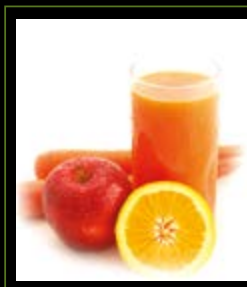
Apple Juice £5.50 Orange Juice £5.50 Mix Juice £6.00 (Apple, Orange & Carrot)