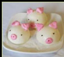
A. 奶黃豬仔包 Custard Piggy Buns £6.80