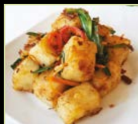
C. XO醬蘿蔔糕 XO Sauce Turnip Paste £6.90