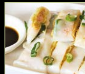
B. 腐皮蝦腸粉 Crispy Cheung Fun £7.80