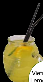
Vietnamese Lemon Juice £5.50